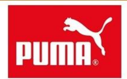
By: SUCHI BANSAL